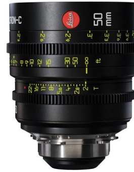
LEICA SUMMICRON-C 50mm T.2 ø 95mm 24" (60.96 cm) 3.2 lb (1.47 kg)