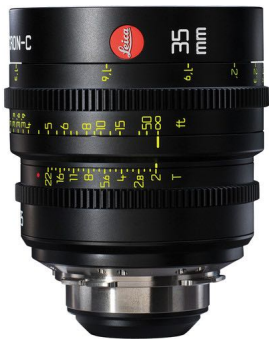
LEICA SUMMICRON-C 35mm T.2 ø 95mm 14.4" (36.6 cm) 2.9 lb (1.34 kg)