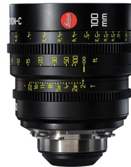
LEICA SUMMICRON-C 100mm T.2 ø 95mm 39" (99.1 cm) 2.7 lb (1.24 kg)