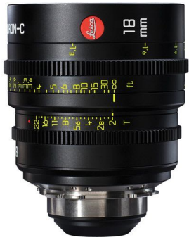
LEICA SUMMICRON-C 18mm T.2 ø 95mm 12" (30.5 cm) 2.9 lb (1.33 kg)