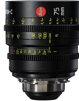
LEICA SUMMICRON-C 75mm T.2 ø 95mm 31" (78.7 cm) 2.7 lb (1.25 kg)