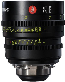
LEICA SUMMICRON-C 25mm T.2 ø 95mm 12" (20.5 cm) 3.4 lb (1.55 kg)